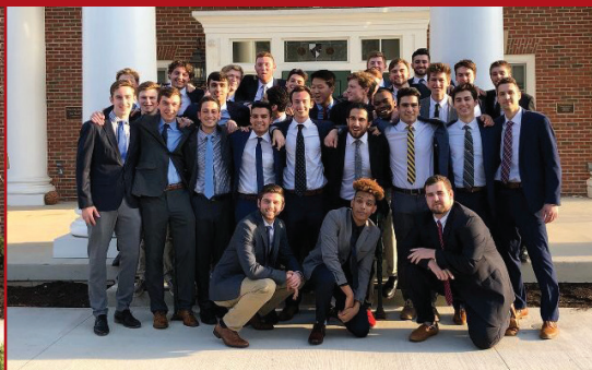
The spring 2018 new member class after initiation.