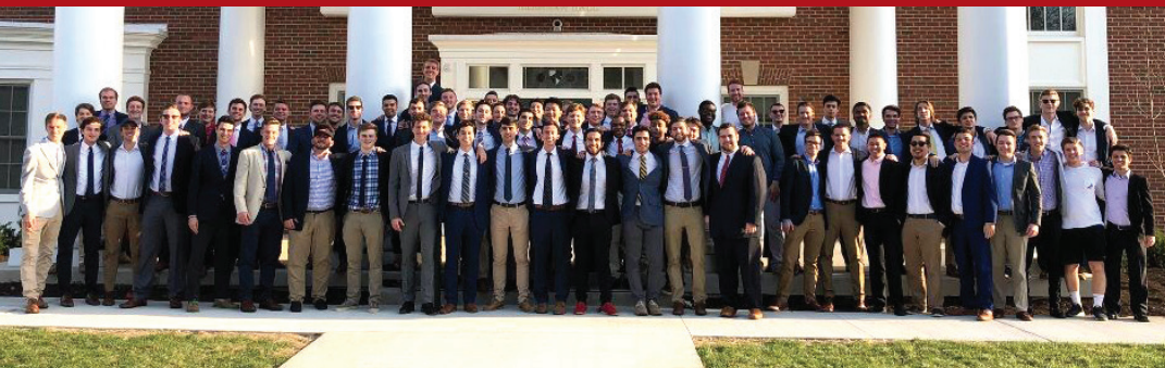
The Theta Delta Chapter of Beta Theta Pi after this spring's initiation ceremony.

Beta Theta Pi at The Ohio State University • Fall 2018