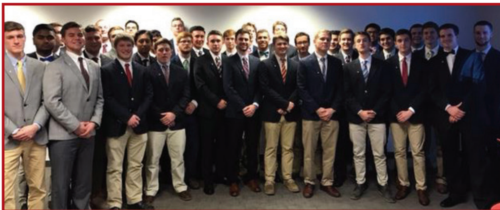
The members of the spring 2017 new member class.

Theta Delta's first annual House of Stars talent show is happening on April 9 at 1:30 p.m. Alumni are welcome to attend, or stream the event online. Visit go.osu.edu/houseofstars for more details.