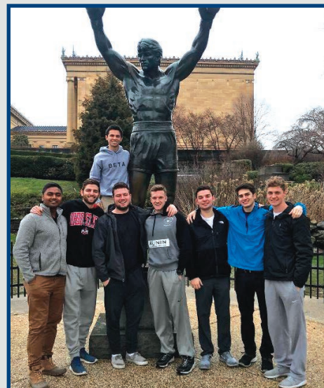
The newly elected executive board at the Rocky statue outside of the Philadelphia Museum of Art.