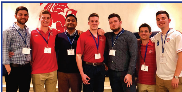
Theta Delta's executive board at the Beta Theta Pi Keystone Leadership Conference in Philadelphia.