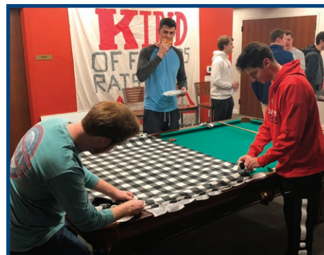
Actives and potential new members made blankets for homeless youth in Columbus as part of recruitment week.

As we move along in the semester, we look forward to our philanthropic event this April, and many in the future.