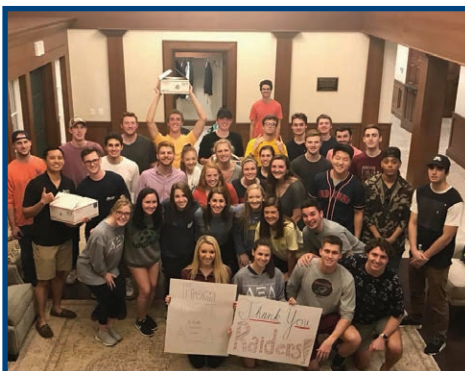
Alpha Xi Delta joined Beta Theta Pi for a service event putting together care packages for Marine Raiders overseas.