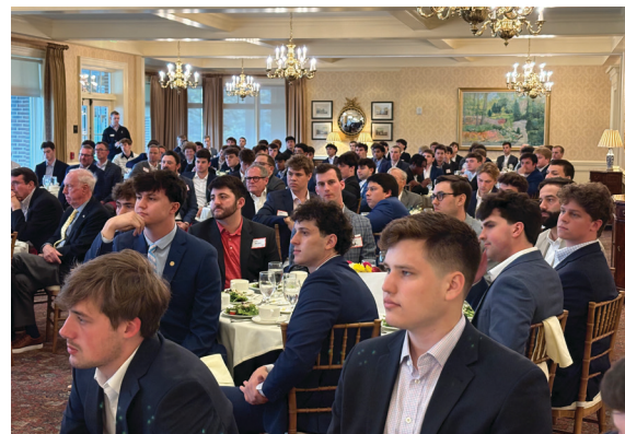
Attendees of the 2025 Beta Roundup listening to Head Football Coach Ryan Day.