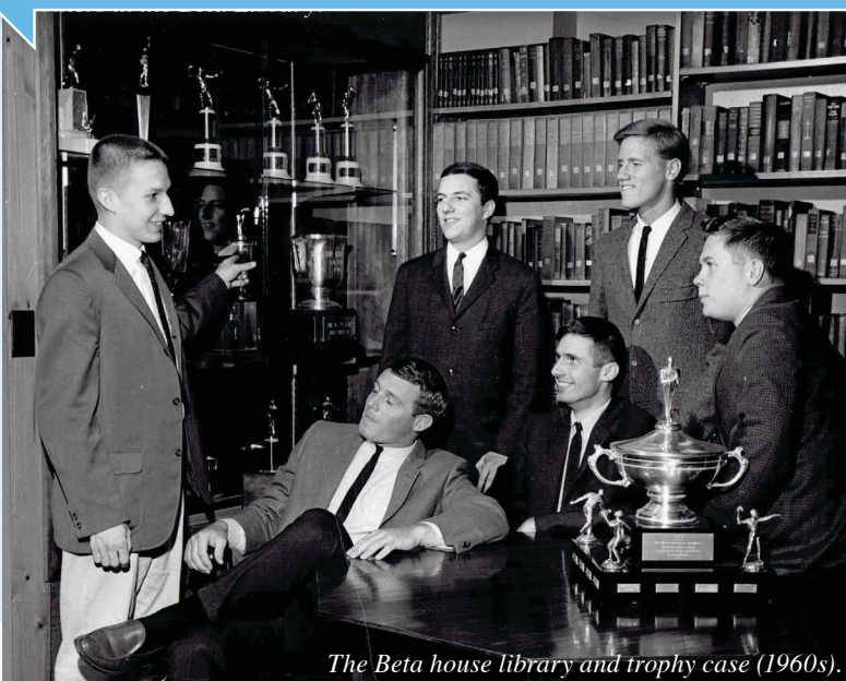
The Beta house library and trophy case (1960s).